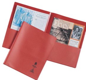
2 vinyl pocket folders (red and blue, no brads)