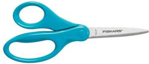
1 pair scissors