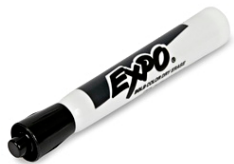
dry erase markers