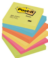
1 pack Post-It Notes (yellow)