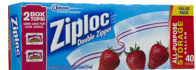
Ziploc Bags (gallon-sized)